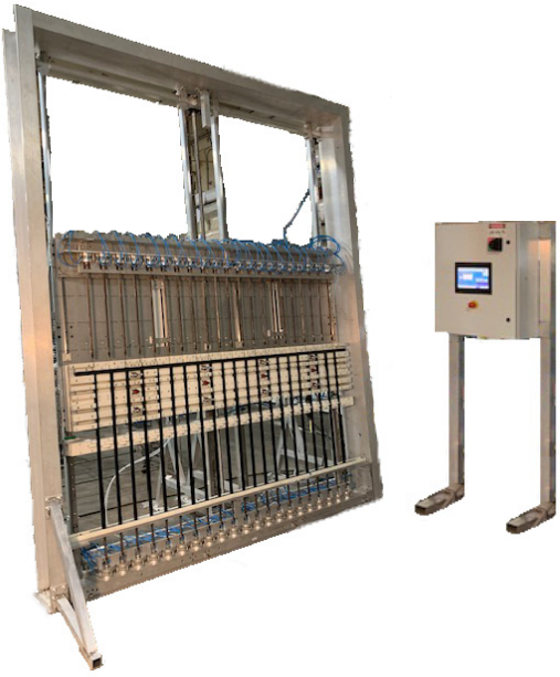
SWEDGEMASTER 4000 SL